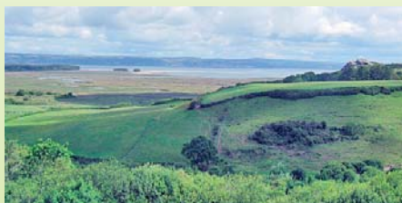
View from the 115 leaving Llanmadoc!

Notes: l - via Llangennith & Llanmadoc c - connection will be made to following bus *6 May to 30 September