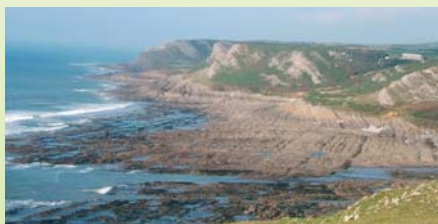
Port Eynon Bay other end of 115 route